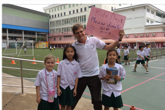
JR Council Community Service

This is an exciting way to demonstrate best practice in teaching and to give students a chance to excel and build their physical fitness to have a healthy body and mind.