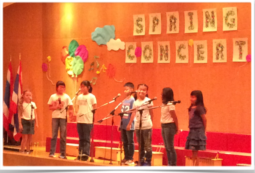
First TCIS Lower School Choir Performs