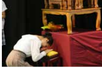
Wai Kru Ceremony