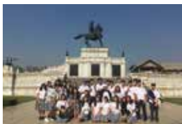
Thai Cultural Field Trips Grade 1- Grade 12